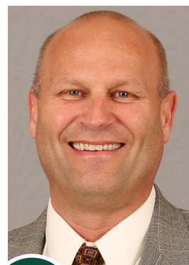
HC Kelly Graves @GoDucksKG