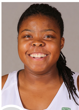
32 Oti Gildon @OtiGildon